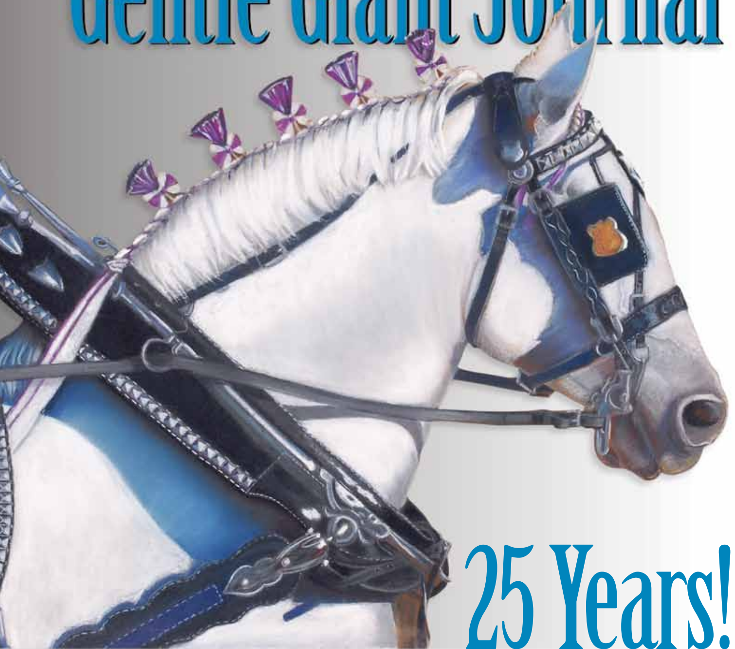
"ELEGANCE IN MOTION," JOAN PACE-DEMOTTE