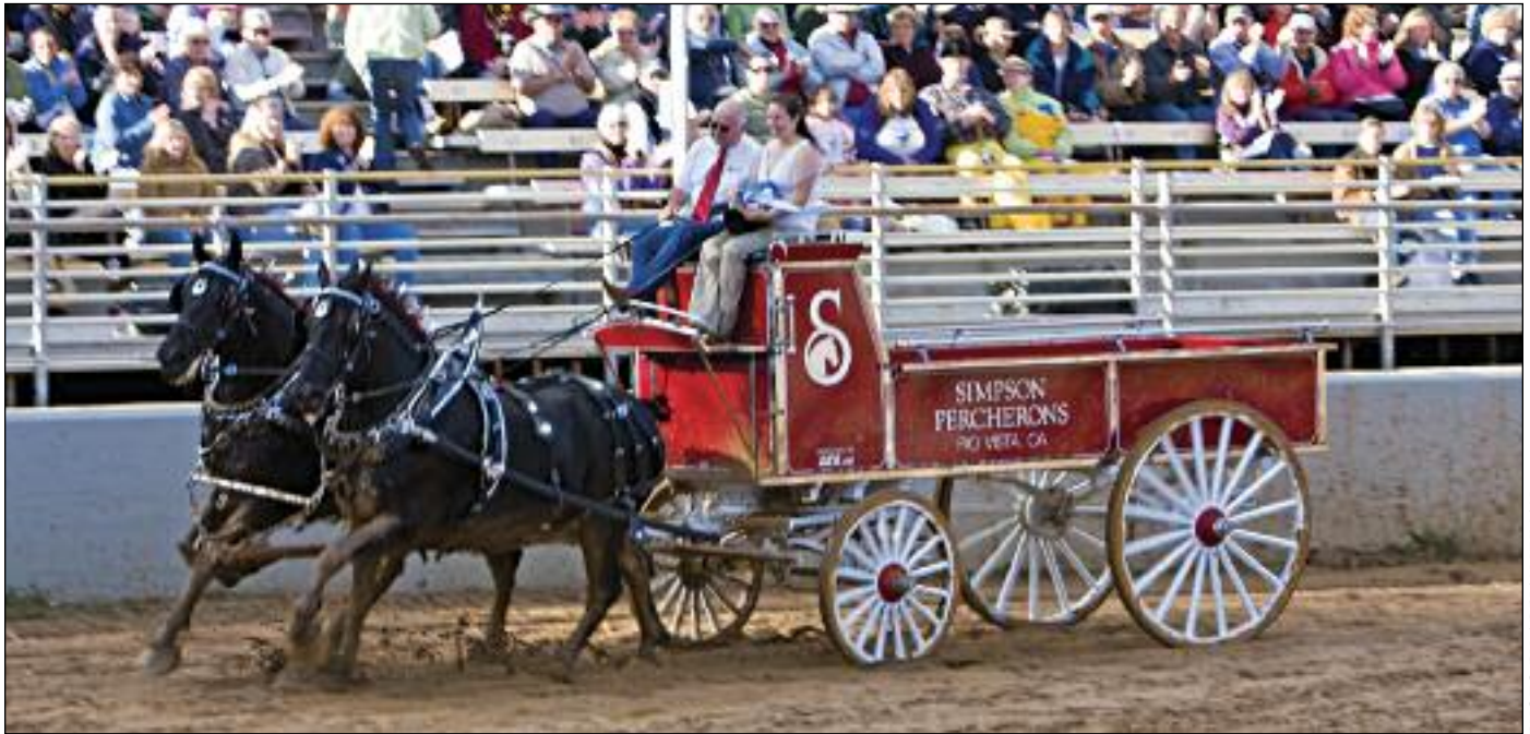
Amidst applause, Simpson Percherons perform for an appreciative audience.