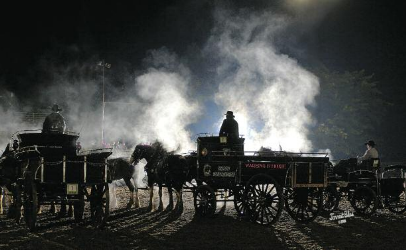
Cooler temperatures create a spectacular backdrop for the judging of the Unicorn performance.